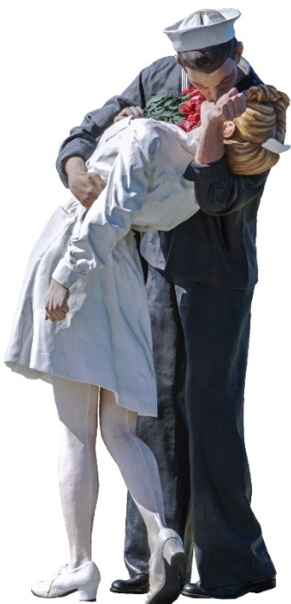
The statue known as "Unconditional Surrender" stands near the USS Midway floating museum in San Diego