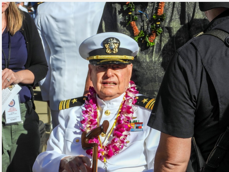
Lt. Commander Lou Conter - one of the last three USS Arizona survivors still alive, and the only one to make it to Pearl Harbor for the 2019 commemoration of the December 7, 1941 attack on Hawaii.